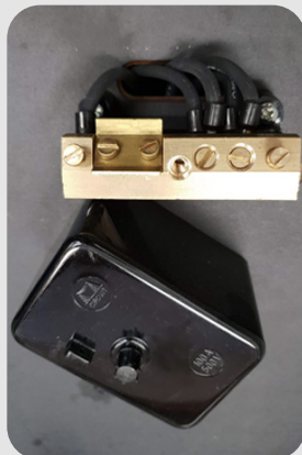
Meter Neutral Link